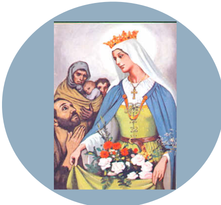
St. Elizabeth, Patron of OFS

Her shrine at one point rivaled Santiago de Compostela in Northern Spain. The magnificent golden shrine can still be seen in the Elizabeth Church in Marburg today despite the fact that this is now a protestant church (in respect of this arrangements have been made so that Catholics may still worship there)