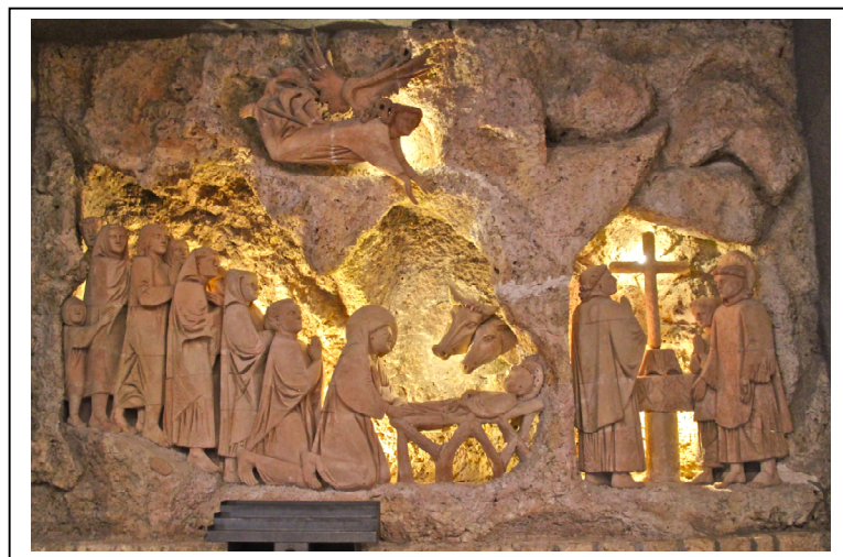
in Greccio

AWE OF ST. FRANCIS' FIRST CHRISTMAS CRÈCHE