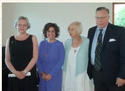
2016 WAS A VERY GOOD YEAR!