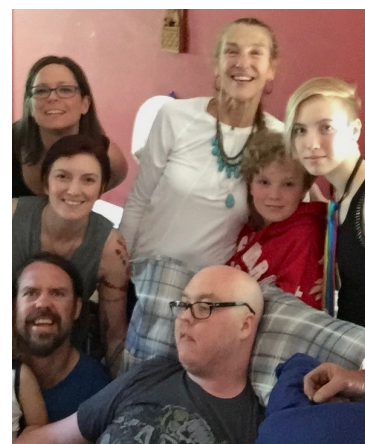
Picture with family in California

Wisdom 4:7-15 "...The just man, though he die early, shall be at rest..."