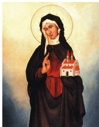
St. Agnes of Prague