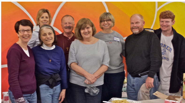
OUR FRATERNITY MEMBERS AND ST. MARY'S FEED THE HOMELESS 4 TH SATURDAY

How can we build bridges? This is "Gospel Activism" not "Social Activism". Jesus, Francis and Clare had vision and passion. What is our vision and passion? How can we embrace the Ten Principles of Catholic Social Teachings and be a witness to them in our Franciscan apostolic life as courageous leaders? ~ from Formation Director's notes