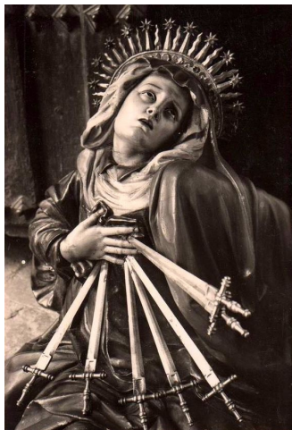
Statue in San Miguel Church in Valladolid, Spain