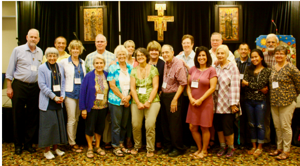
Last year's attendees from Padre Pio.

The Annual Regional Gathering-will be held August 3-5, 2018 at the Conference Center in Ridgecrest, NC. The visitors will be from the National organization, It's a good way to meet and to get to know our National Council members.