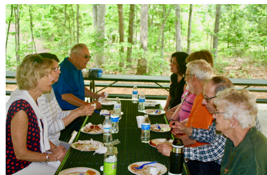
In God's good environment!