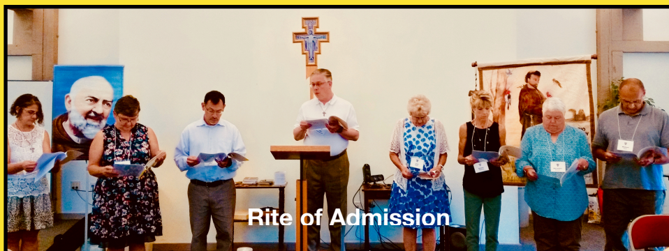
Rite of Admission