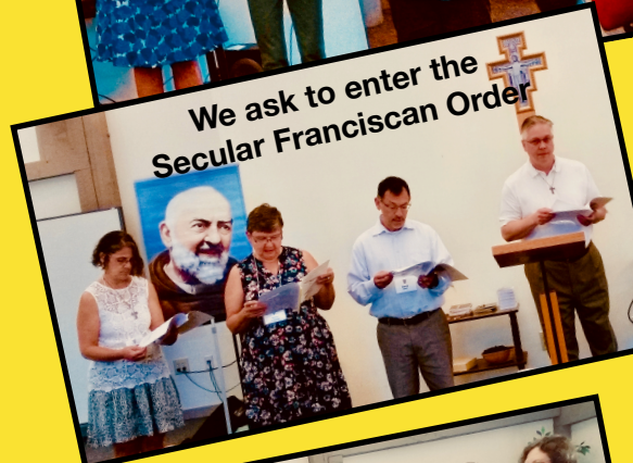
We ask to enter the Secular Franciscan Order