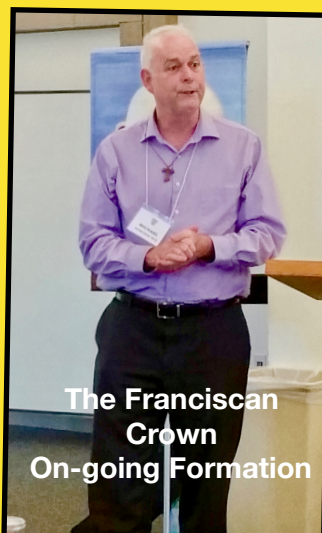
The Franciscan Crown On-going Formation