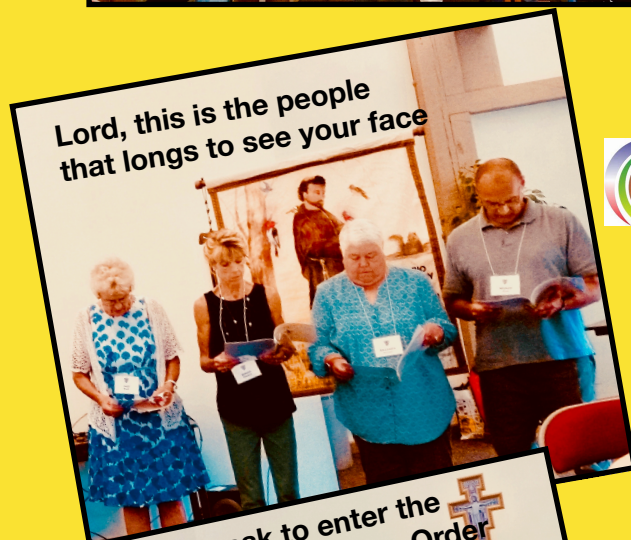
Lord, this is the people that longs to see your face