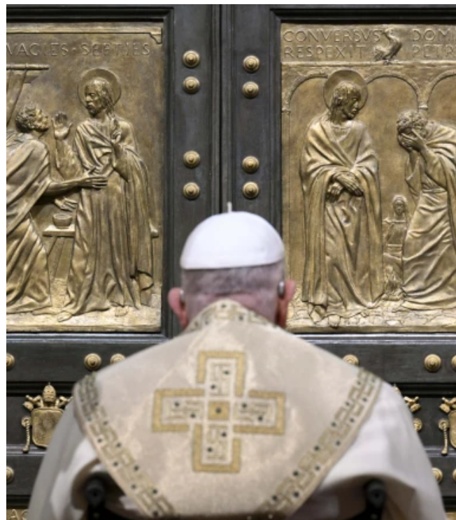
Pope Francis opened the Holy Door of St. Peter's Basilica before Mass on Christmas Eve, Dec. 24, 2024, officially launching the Jubilee Year 2025.

Father in heaven, may the faith you have given us in your son, Jesus Christ, our brother, and the flame of charity enkindled in our hearts by the Holy Spirit, reawaken in us the blessed hope for the coming of your Kingdom. May your grace transform us into tireless cultivators of the seeds of the Gospel, May those seeds transform from within both humanity and the whole cosmos in the sure expectation of a new heaven and a new earth, when, with the powers of Evil vanquished, your glory will shine eternally. May the grace of the Jubilee reawaken in us, Pilgrims of Hope, a yearning for the treasures of heaven. May that same grace spread the joy and peace of our Redeemer throughout the earth. To you our God, eternally blessed, be glory and praise for ever. Amen Source: Give Us This Day